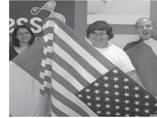
Award winners Lead Generation winners

Our aim is to be recognised as ‘the choice’ for business voice and data solutions