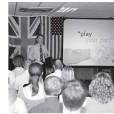
Midus Green Team Blueprint Conference

Our values are at the core of the Midus Culture' Our values influence how we are perceived, how we communicate with our colleagues, customers, partners and suppliers and how we behave and perform.