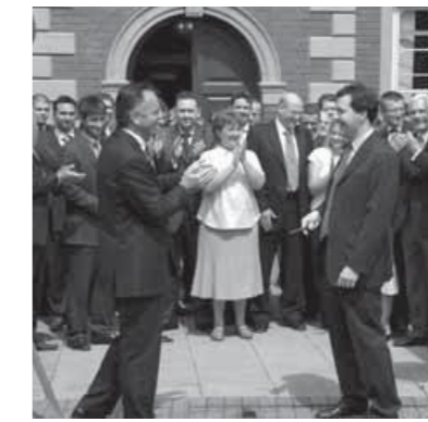
New office opening

“the reasons why we want to grow Midus ”