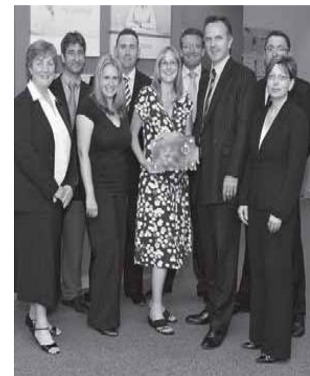
Senior Management Team

I am pleased to present you with a copy of our Blueprint for Success .