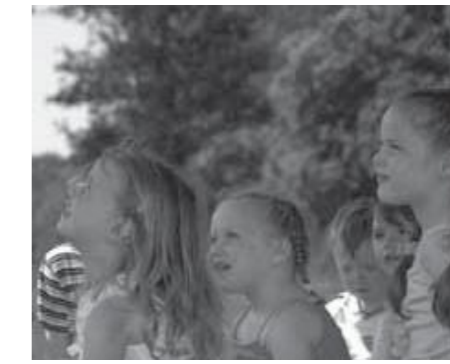
Cultural Architects Midus Summer BBQ